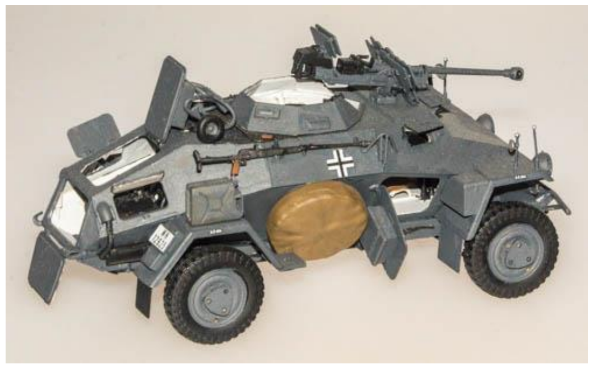
Arthur Berwick's a LE P2 SP Panzer Spahwagan.