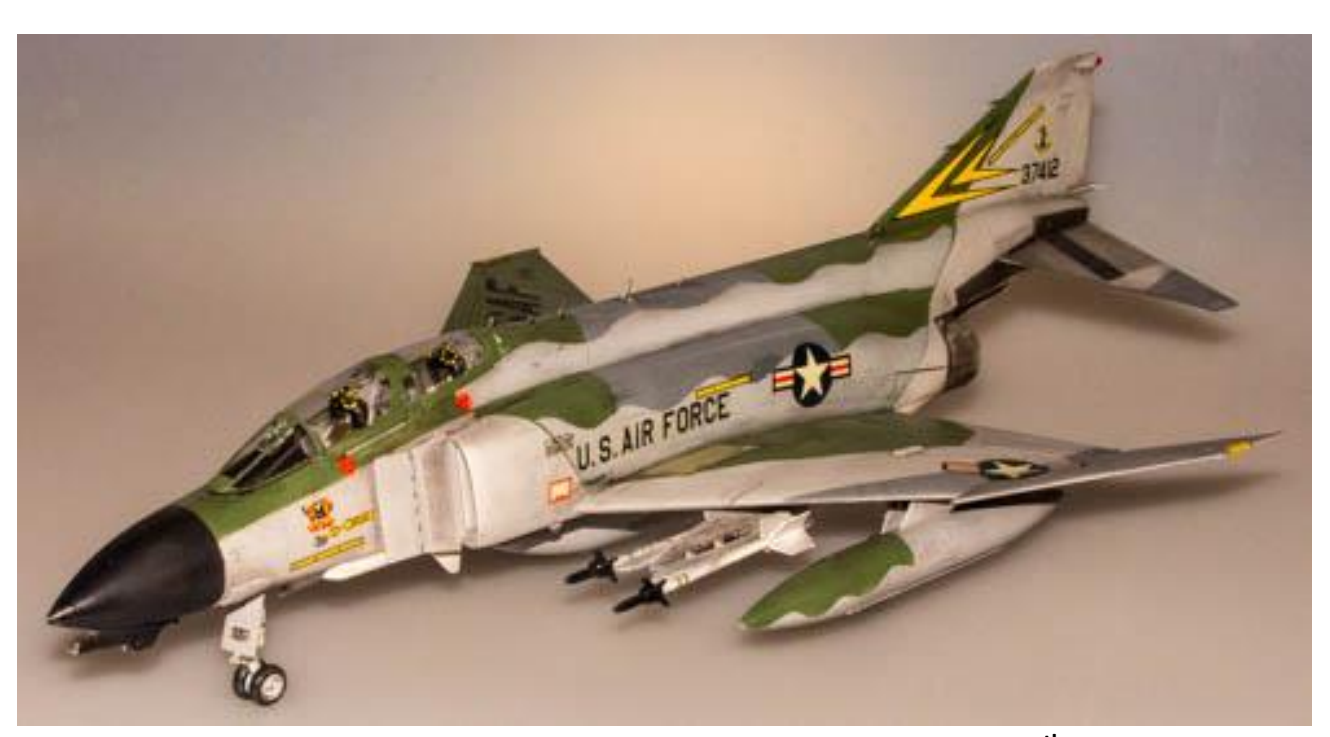
Carlos Delgado's F4 Phantom built from the Hasegawa 1/48<sup>th</sup> scale kit,