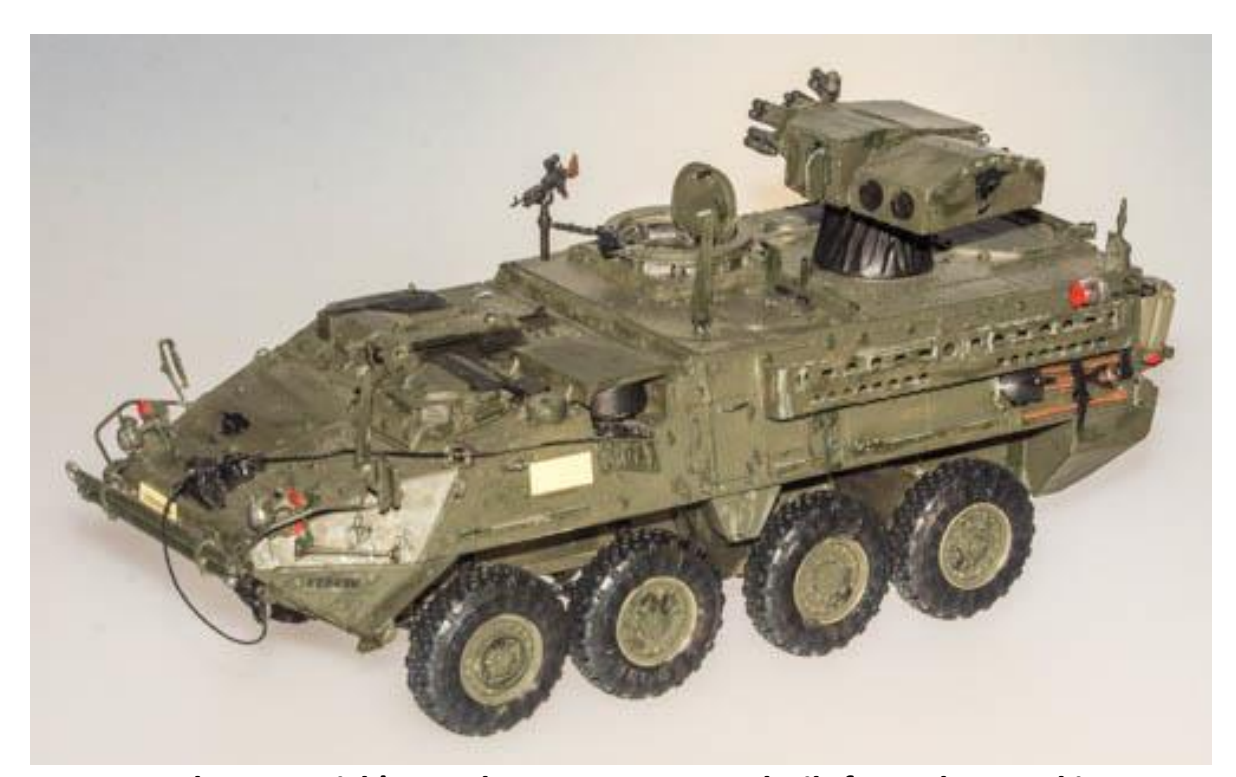
Arthur Berwick's Stryker M1134 ATGM built from the AFV kit