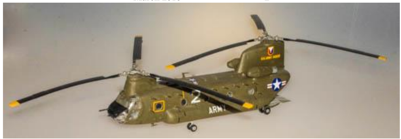
Tommy Delgado's CH-47A Chinook in 1/72nd scale.