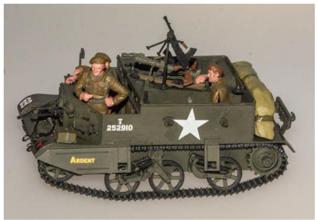
Arthur Berdick's Universal Carrier in 1/32<sup>nd</sup> scale.