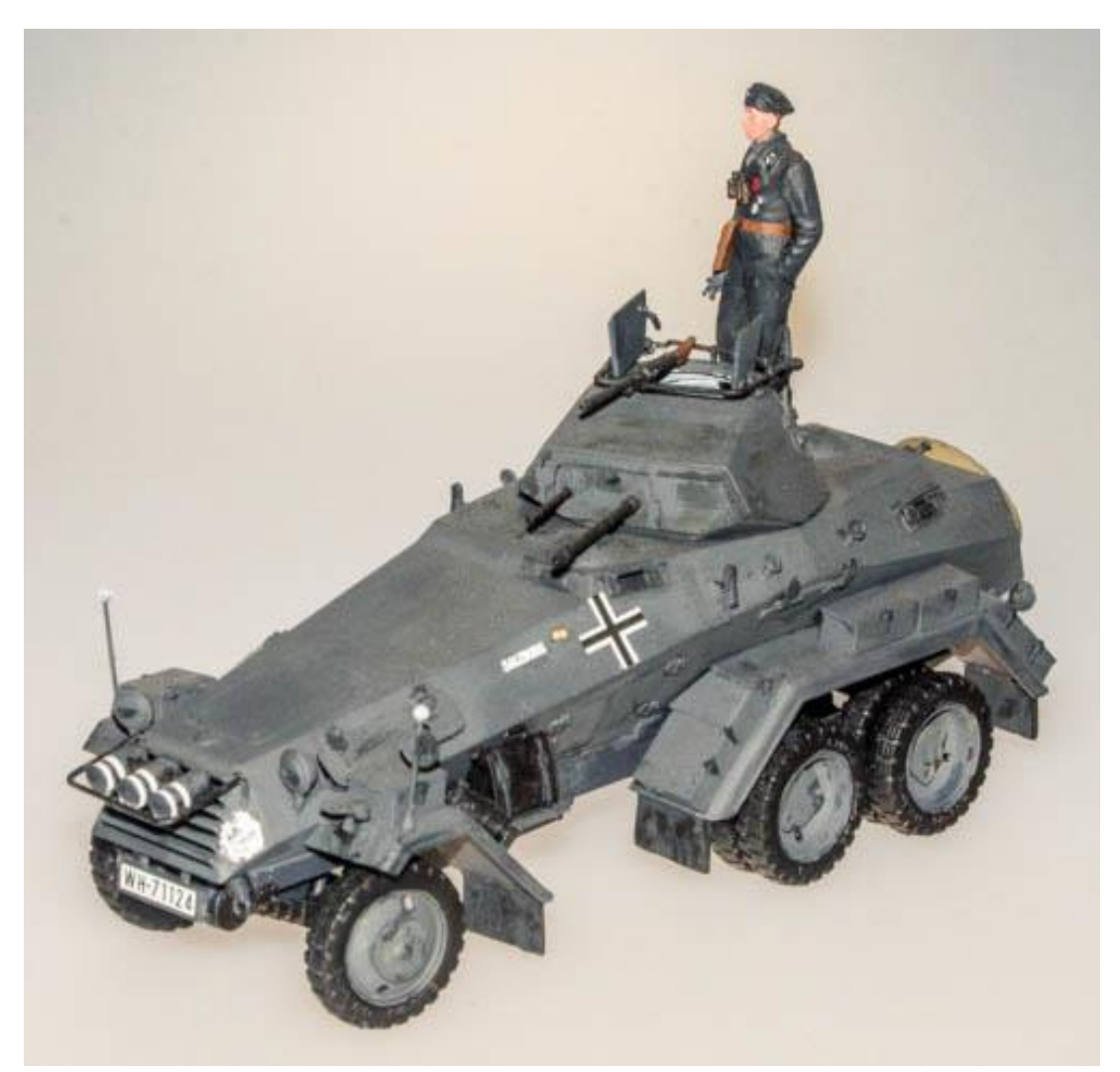
Arthur Berwick's Sd.Kfz 231 six wheeled Heavy Armored Car